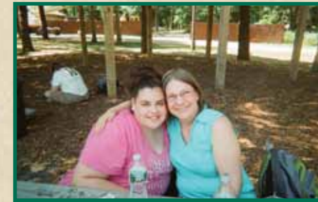
Kehilla Vocation participants take a break for lunch during a busy day.

Once again, our Kehilla Camps were a vital part of the lives of special needs children, teens and young adults all over Long Island. The camps provided an emotionally safe environment for those with autism, attention deficit disorders, learning disabilities, speech and language delays and emotional/behavioral disorders who were not able to meet the socialization demands of typical local camps. Camp Kehilla, located at the Henry Kaufmann Campgrounds in Wheatley Heights, provided children and teens ages 5–17 with an exceptional day camp experience, including such camping classics as swimming, trips, crafts and sports. The Kehilla Vocation Experience gave young adults ages 18–21 vital social and life skills while working at vocation sites throughout the summer.