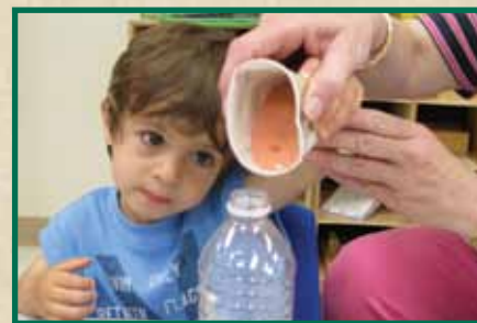
It's arts 'n' crafts during Early Childhood summer programs!