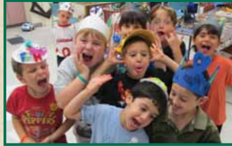
Summer Streeters campers show their creative sides during arts n' crafts.

Did you hear the singing and chanting through the halls of the JCC this summer? That was Summer Streeters , which provides a high-quality camp experience at the most affordable price on the North Shore. With fantastic theme weeks, camp-wide trips and tons of activities, Summer Streeters was an amazing time for children in grades K–6.