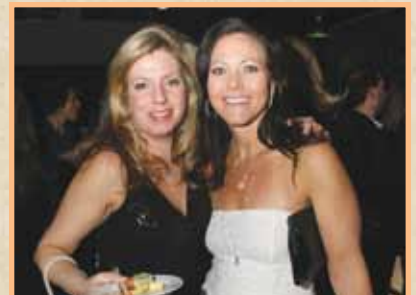
New changes to this year's Auction See page 4