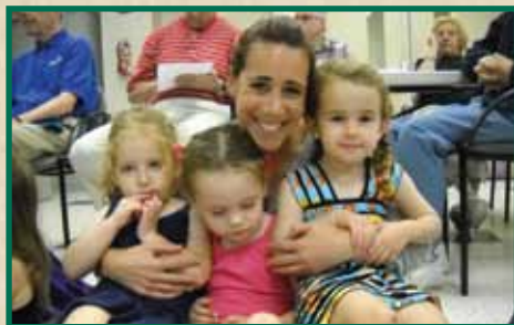
Campers enjoy Tot Shabbat with the Friendship Circle, the JCC's day program for the frail elderly with Alzheimer's disease and other dementias.

This summer, our Early Childhood Center summer programs offered a well-rounded schedule for children ages 2–3, including swim, gym time, music, art and transportation options. Most importantly, the camp gave these kids their first summer camping experience!