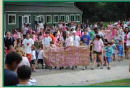
Camp Jacobson at Robin Hood leads the march against breast cancer during its annual Walk for Breast Cancer. Campers raised $2,500 for Sharsheret and the Avon Walk.