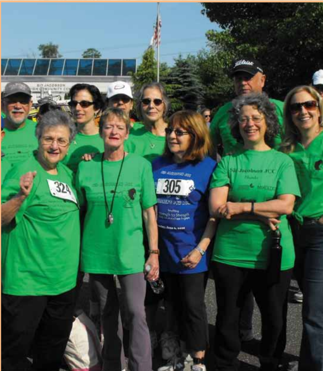
Members of Sid Jacobson JCC's Strength to Strength program and 5th Annual 5K Run/Walk and Children's Fun Run.