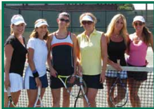
Women's Pro-Am Tennis Tournament