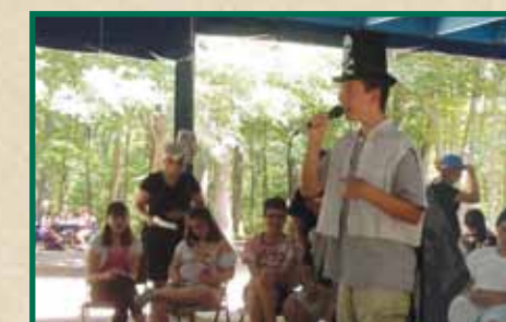
Kehilla campers wrote and performed a musical that was performed for the entire camp.

Due to a grant from UJA-Federation of New York, Camp Kehilla was able to welcome The Miracle Project , a program that enables children and teens with autism and other special needs to express themselves through music, dance, acting, storytelling and writing. The result was a show that showed off the incredible musical and acting abilities of these campers.