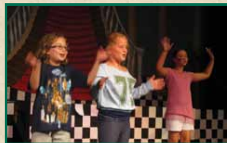
Camp ACA gave these young actors the Broadway edge.