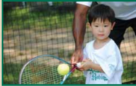
Camp Jacobson at Robin Hood's tennis clinics "serve" even the youngest campers.

located on our 15-acre Bernice Jacobson Day School & Camp, provided children ages 3–16 with a fabulous summer camp experience. With over 25 activities and camp-wide events, including trips, sports clinics, swim classes and art, our campers gained both important life skills and friendships that last a lifetime.