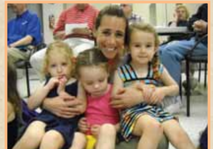
Summer Camp Roundup See page 8