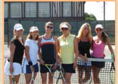
26th Annual Golf & Tennis Outing See page 6