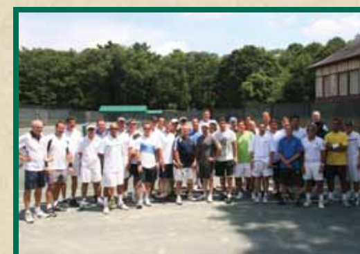
Men's Pro-Am Tennis Tournament