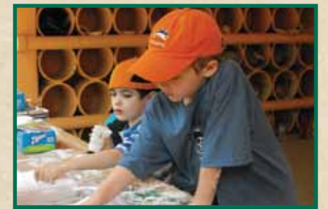
Kehilla campers get a sensory experience with fake snow during summer.