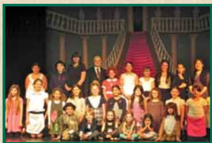
Summer Stock participants and the cast of Annie brought the beloved musical to life.

The Theatre Department offered two programs this summer: Summer Stock , which produced the fabulous Annie , and Camp ACA , a comprehensive Broadway summer camp with workshops taught by Broadway stars. Our growing thespians, all in kindergarten through grade 12, really had a time to shine!