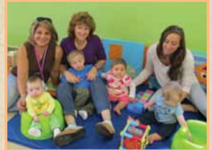
JCC introduces NEW! Infant & Toddler Daycare See page 10