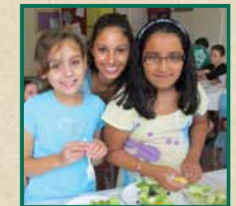
Summer Streeters campers enjoy the rewards of a sustainable garden by making a delicious meal with fresh fruit and vegetables during a cooking class.