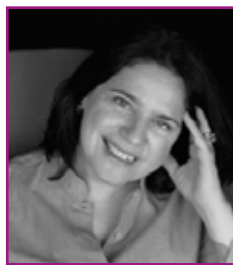
The Three Weissmanns of Westport By Cathleen Schine