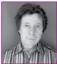
Lush Life By Richard Price